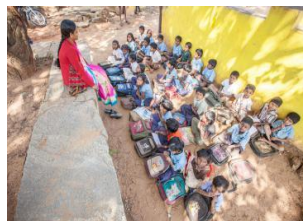
Kids sitting under a tree

Below are pictures of the school before and after OSAAT intervention: