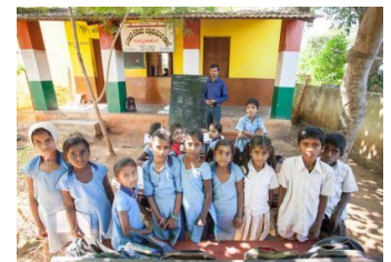
Another classroom, another tree